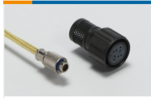
Standard Circular Connectors(519)